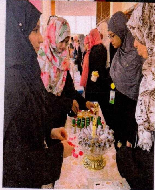
Faculties from various departments visited the stalls

[Handwritten signature] 22/8/22 PRINCIPAL