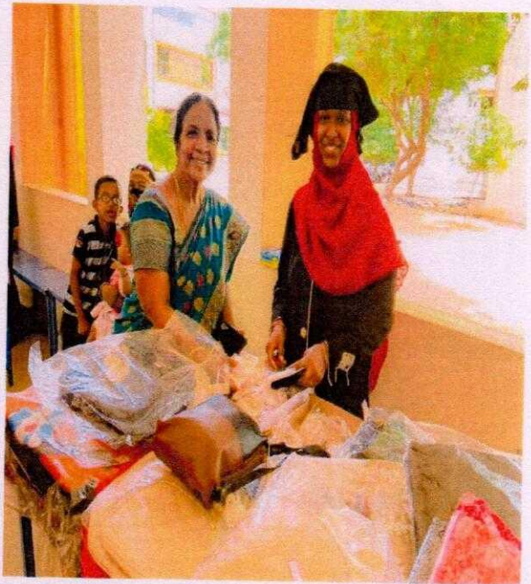
Products are exhibited and sales made Students are visited the stall arranged by Alumnae Entrepreneurs from various batches